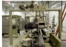
Edson 3100 Case Packer