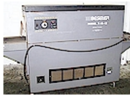
Beseler T15-12 Shrink Tunnel