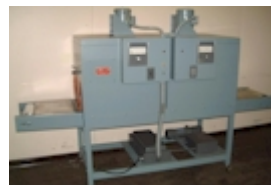
Shanklin T-62 Shrink Tunnel