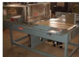
Shanklin CF-1 Shrink Auto