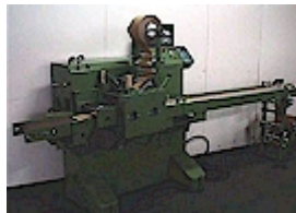
Pak Rapid AH-8 Bagger Single Lane