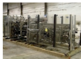
Langen B1/AL Horizontal Cartoner