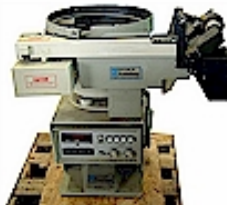
Automated Accu-Count 118