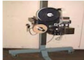
Label Aire 2111-M Label Applicator