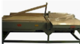
Shanklin S-5CL Tunnel