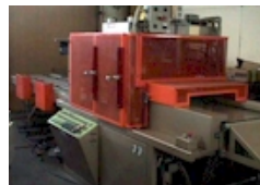
Zed Auto Skin-N-Trim Skin Packager