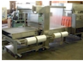
Polypack IL-40-HL Bundler