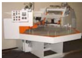
Sentinel 930 R Rotary Blister Sealer